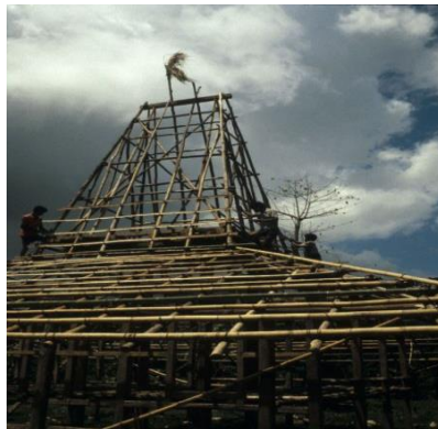
Figure 5. the soaring and sloping roof frame of Uma Sumba