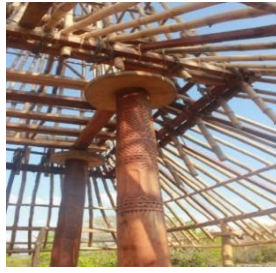
Figure 4. Construction details of top part of pongga bokolo, the circular disc is named lele