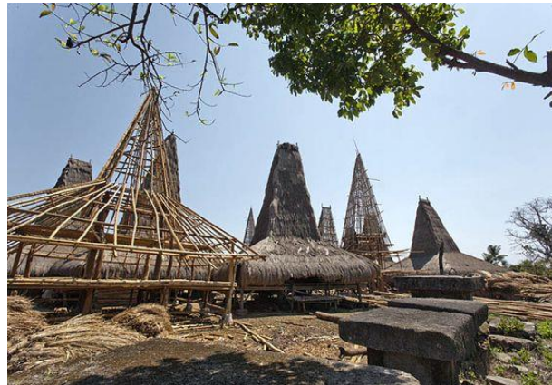
Figure 1. Uma Sumba group in Wainyapu, Southwest Sumba.

By believing that this traditional or Archipelago architecture existed in Indonesia before the 19th century, this paper tries to understand the behaviour of wooden architecture in the face of earthquakes, bearing in mind that Indonesia is one of the places on earth that is in the ring of fire area. This understanding was carried out through careful observation of the Uma Sumba building process which maximally imitated the building traditions before the 18th century.