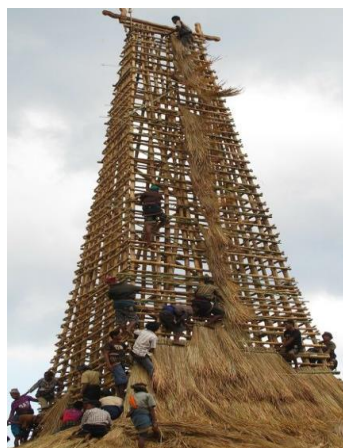
Figure 6. Covering the roof with reeds