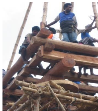
Figure 3. The ends of the stacked beams