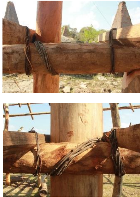
Figure 7, top and above. Binding techniques

The construction involves installing diagonal ridges made of bamboo, rafters and laths made of bamboo, and lawiri (a pair of wood rectangular beams) at the bottom of witi karimbiyo . Lawiri is used as a place of the sloping roof rafters to rest and bind to witi karimbiyo .5. construct secondary pole, pongga ripi , and secondary beams, patenga ripi . This construction is located at the outer boundary of Uma Sumba as well as being the basis for the sloping roof frame that surrounds the tower section of Uma Sumba (the part of building marked by four pongga bokolo-s ). these twelve pongga ripi-s are about four meters away from pongga bokolo , and also planted into the ground.